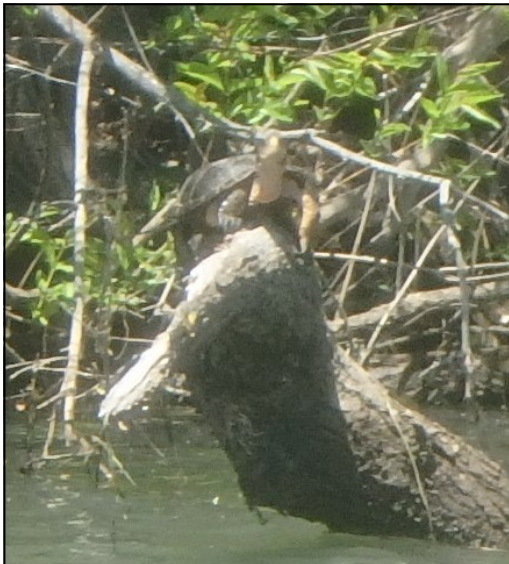
One of many turtles along the Consumnes

We saw otters and many, many turtles. However, the most impressive wild animal display were the numerous fairly large carp which were spawning. They seemed to be everywhere, including tangled up in a beaver dam they were trying to get thorough. Chris paddled into the brushy dam and untangled one carp so it could be on its way. Carp, being an invasive species, triggered a discussion on the water of invasive species. Associated photos may or may not reflect that discussion rather than actual experience on the trip. A breeze came up as we were heading back to the launch, but in essence, the weather was near perfect.