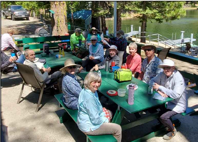
Food and fun at the Grass Valley Rifle, Rod, and Gun Club Lodge at Fuller Lake.