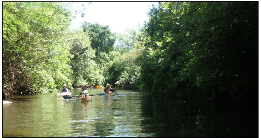
Cruisin' down the river.