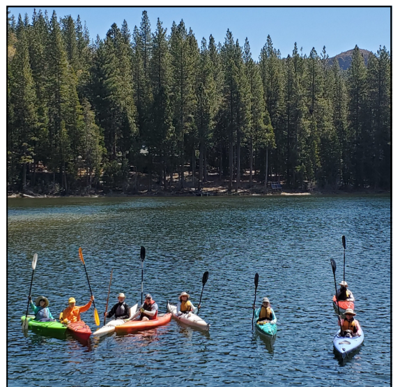
A beautiful lake on a beautiful day.